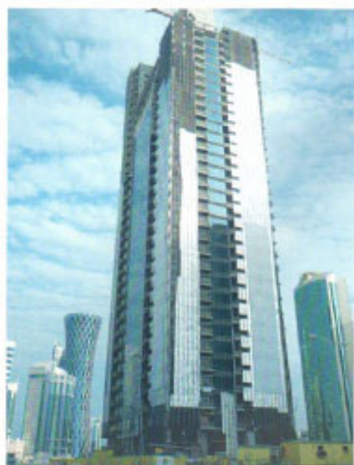
Dareen Tower at Dafna Client : Al Habtoor