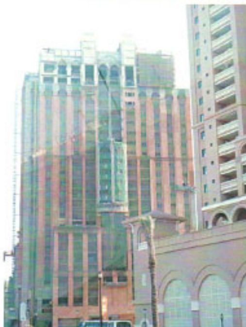
Residential Building No. 12 & 14 at Pearl Qatar Client : Simplex Infrastructures Ltd.