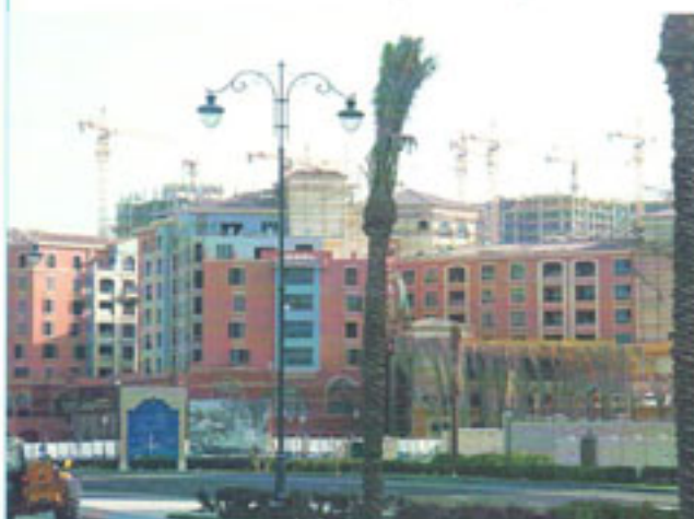
Madina Centrale at Pearl Qatar Client : Power Line Engineering – Qatar W.L.L.