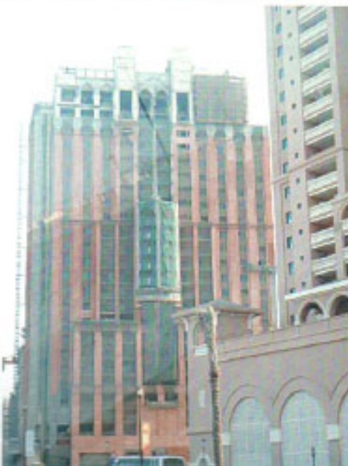
Residential Building No. 12 & 14 at Pearl Qatar Client : Simplex Infrastructures Ltd.