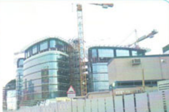
Business Park & Hotel Facility at Najama Client : REDCO Construction – Almana