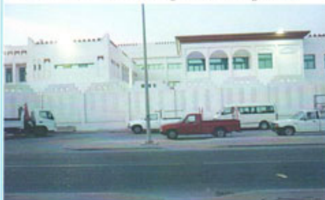
Hamed Bin Harbail Independent Secondary school at Najama Client : INSHA Contracting & Trading W.L.L.