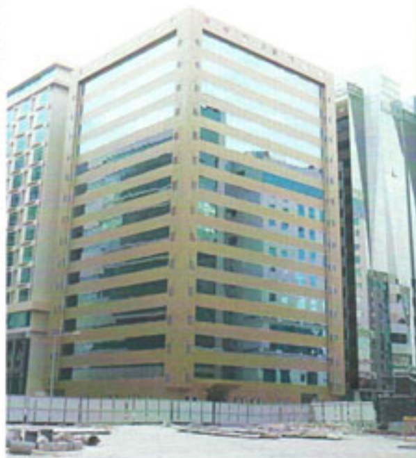
Wakra Tower at Old Salata Client : AL Khayarin Group (KG)