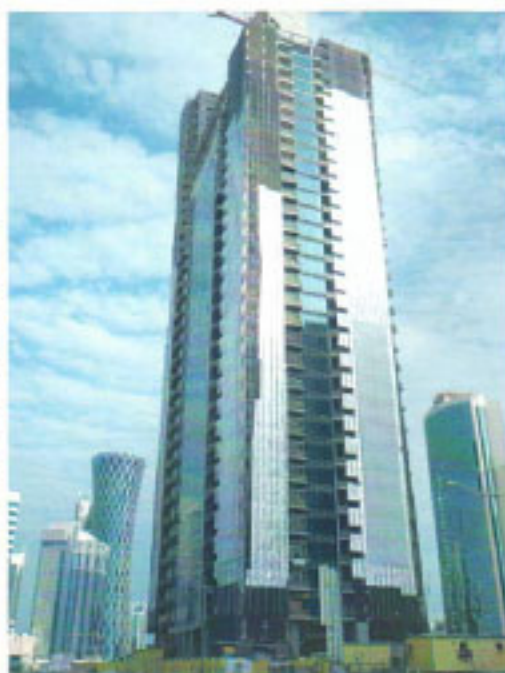
Dareen Tower at Dafna Client : Al Habtoor