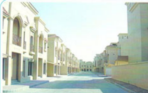
75 nos. Villas at Ain Khalid Area Client : SHANNON Trading & Contracting W.L.L.