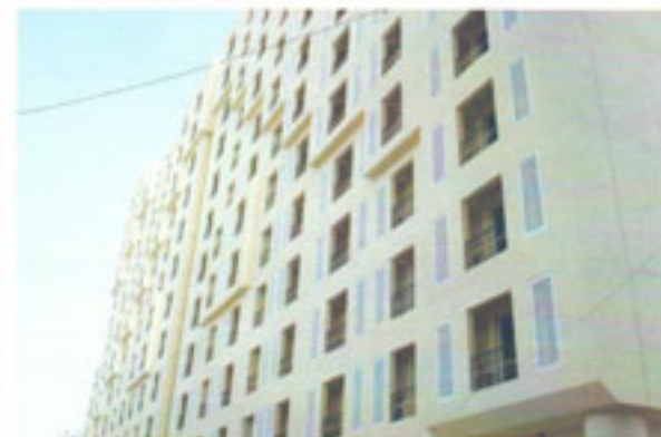
Twin Tower at Abdul Aziz Area Client : SHANNON Trading & Contracting